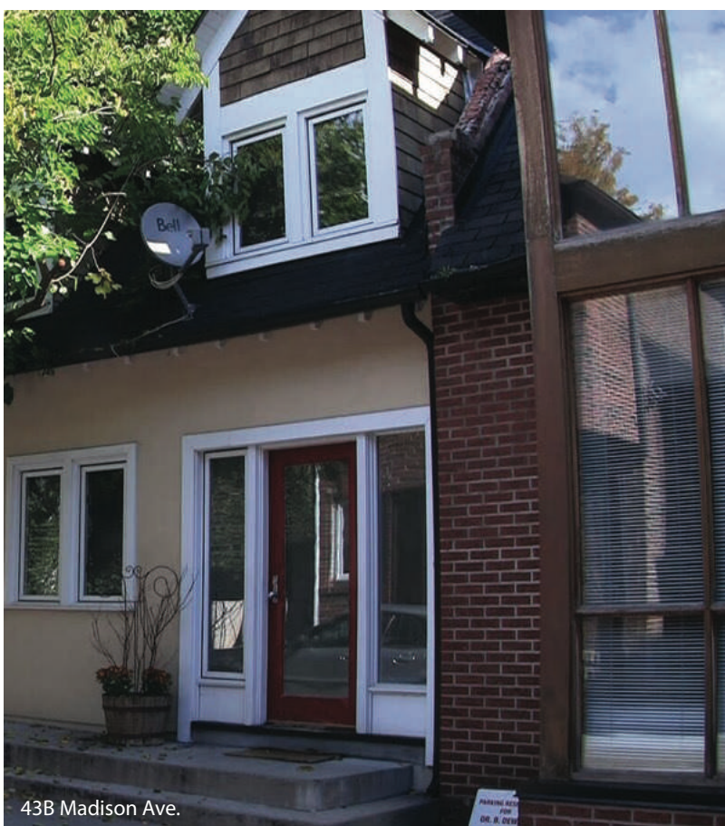
43B Madison Ave.