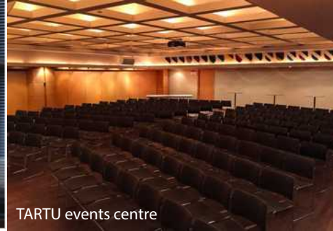
TARTU events centre